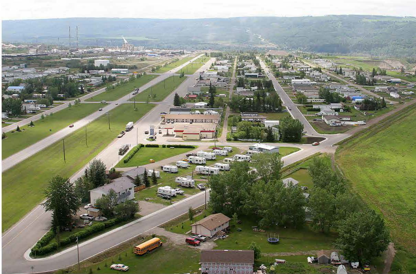
Downtown Taylor, B.C.